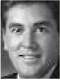
SENATOR MIKE BALBONI NEW YORK