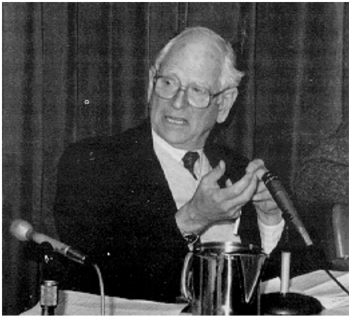
Professor Robert A. Dahl of Yale University, First Speaker in new videotaped lecture series.