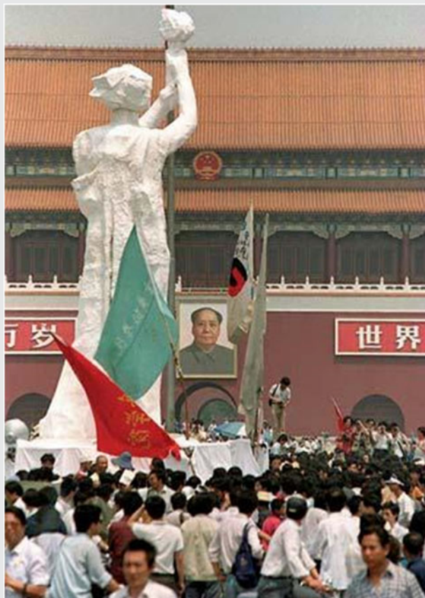
Figure 3 The Goddess of Democracy, Tiananmen Square, 1989