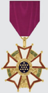
Legion of Merit